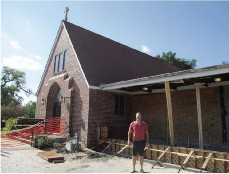
Changes happening on the outside of the Ascension Lutheran church will shore up a complete remodel going on inside the Pratt church.